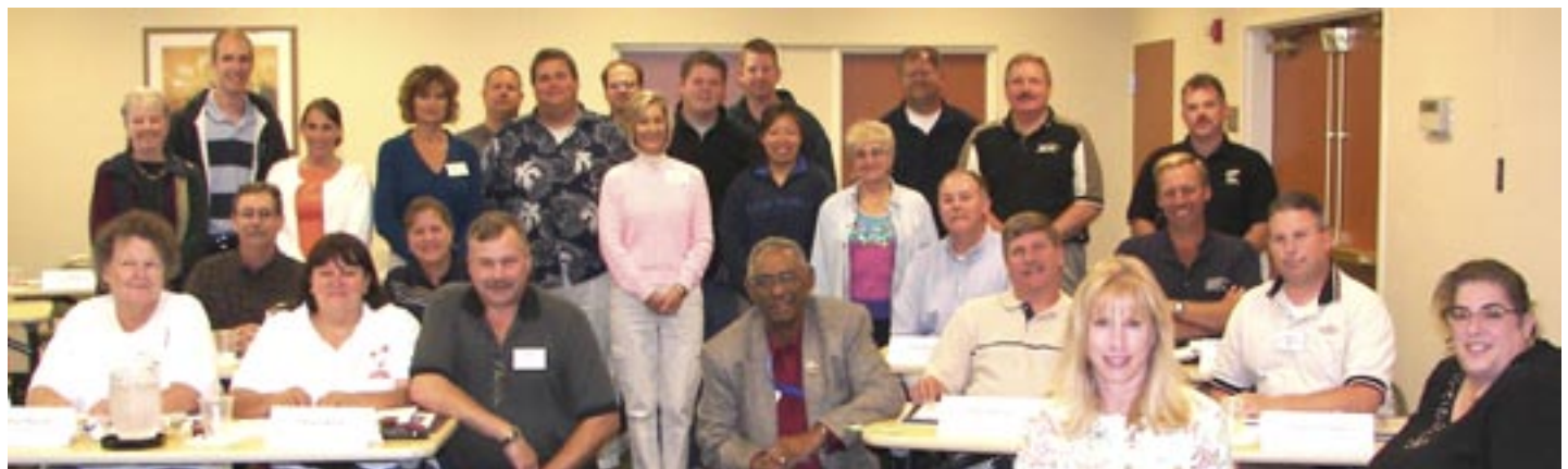
Pictured Above: Police, Sheriff's and EMA agency Volunteer Coordinators and key volunteers from four states together in September 2006 at the Ohio two-day workshop, "How to Recruit, Manage, Reward and Retain Law Enforcement Volunteers" workshop presented by the Public Safety Volunteer Institute.